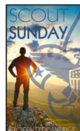
Scout Sunday program cover