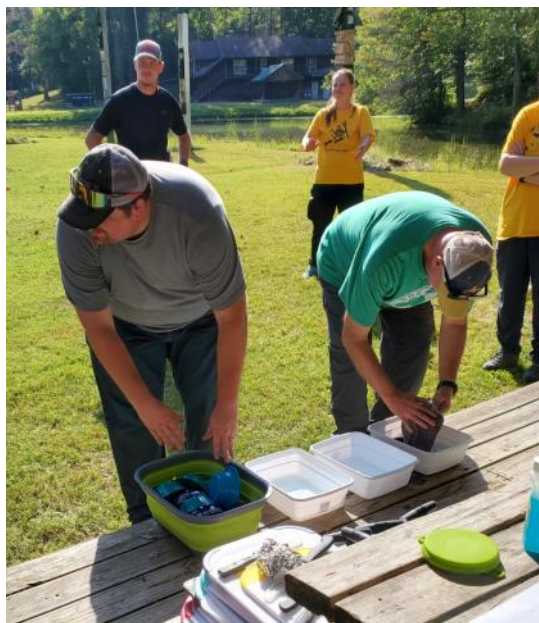
BALOO participants learn the "3 pot method" of cleaning dishes.